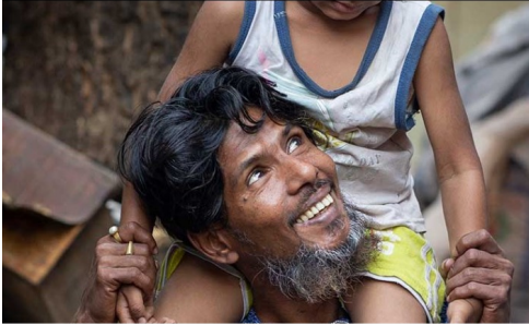
World Tuberculosis Day 2022